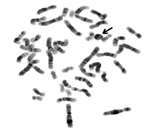
Figure 1. Metaphase of the case